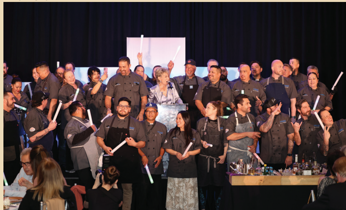
A powerhouse lineup of culinary talent lit up the stage at Top Chef Orange County 2025 as more than 50 chefs were honored