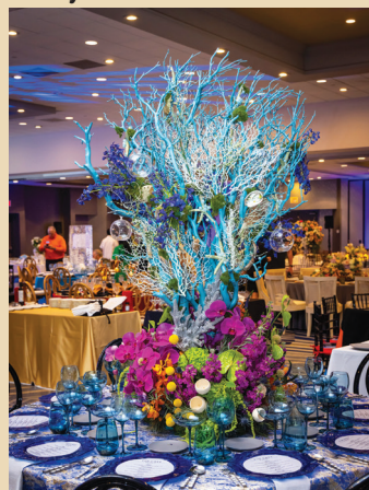
A visual feast in every sense - under-the-sea inspired tablescape