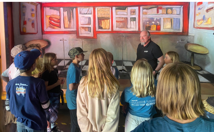
Pageant of the Masters staff give a tour to students from Laguna Beach