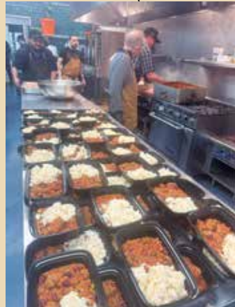
Bolognese Sauce and Rice are packed up to be sent out to fire victims