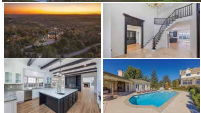
Fallbrook I Sold for $2,400,000 3875 Peony Dr. 15 bedrooms 5.5 bath 6,550 sq. ft. approx. Does not include guest quarters & pool house